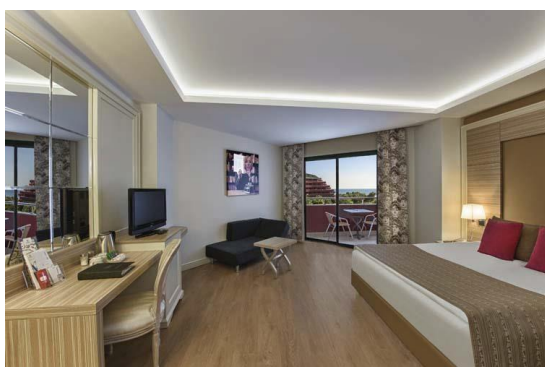
Family Room (Parents)

Technical Details Hotel for Disabled Guests: in total 5 rooms, have the same features as the standard rooms, an emergency button, shower / WC are available. The rooms have Land View. Technical details: door 80 cm, balcony door: 85 cm, elevator door: 80 cm, bathroom door: 80 cm. The reception, restaurants, swimming pools and the beach are accessible with a wheelchair.