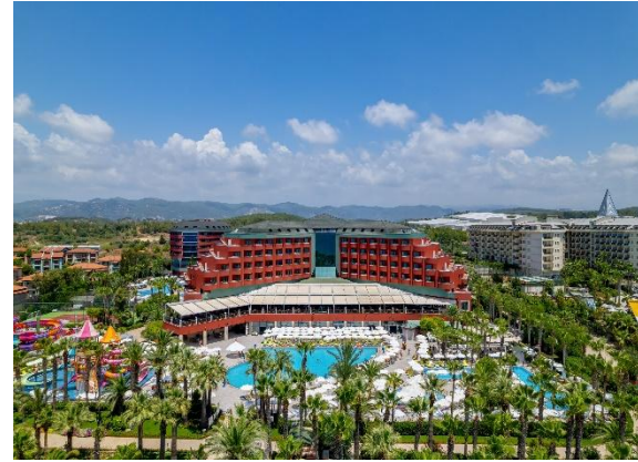
Main Building and Annex Building