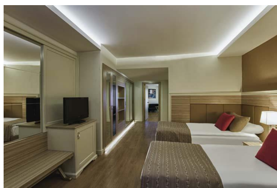
Family Room (Children)

Family Room: 43 m 2 . There is 1 parents room (1 french bed + 1 sofa), 1 children room (2 Single bed), LCD-TV, shower / WC, minibar, telephone, laminate flooring, balcony, safe, hair dryer Everyday: room cleaning, change of towels. Once Every 2 days: change of bed linen (Accommodation maximum: 3+2 or 4+1) (Sofa Bed: 179 x 75 cm).