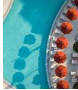
Lagoon Exclusive Pool