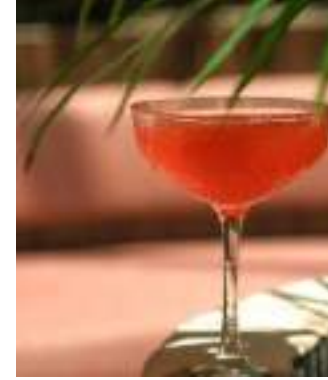
Daily Pop-up Treats