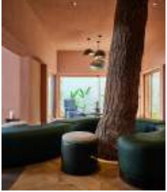
Lagoon Club House