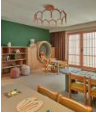
Kids Club Corner for Lagoon