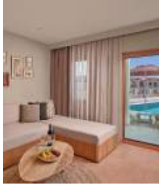
Unique Family Friendly Comfort